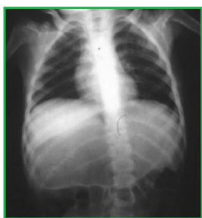
The radiology image of a ten-year-old mentally disabled kid's chest

When used incorrectly, rehabilitation devices can cause undesirable side effects for users.